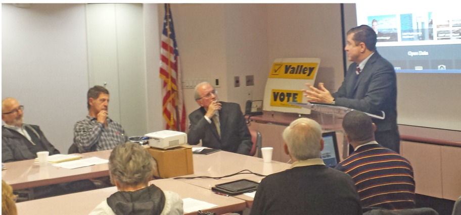
Discussing DWP Reform with members of Valley Vote.